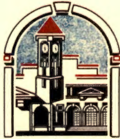
"City on the Gulf"