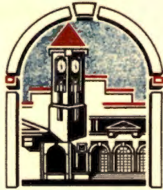
"City on the Gulf"