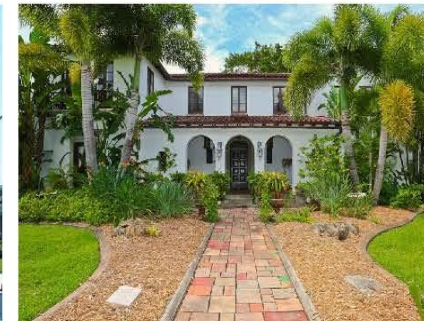
613 West Venice Ave.