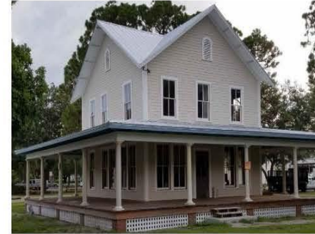
409 Granada Ave.