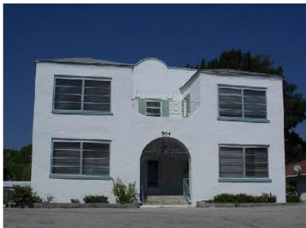
504 Armada Rd. South