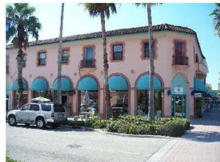
201-203 West Venice Ave.