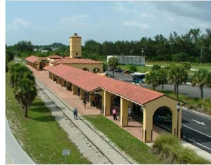
303 East Venice Ave.