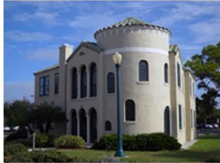
351 Nassau St. South