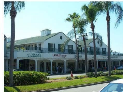
229 West Venice Ave.