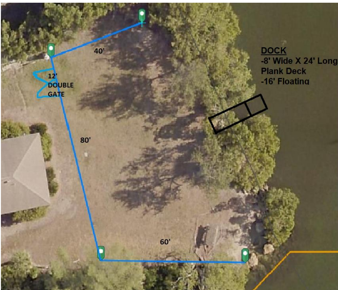
Figure 1: Site Layout (not to scale)

The VYBA staff and board members have been in touch with the Venice Director of Public Works as well as members of the Sarasota County maintenance crew to determine the best use of the park for boat storage and launching purposes. It was suggested that VYBA make the fencing structure so that the area required the least amount of maintenance possible for the county operation crews. This led to the design of a fence and gate that allows for easy access to utility meters that are in place but does not require additional weed eating or mowing around structures. The fence encloses the entire back lot area of the park. The proposed fence will be white vinyl to match the adjacent fence at the VYBA yard. This will also provide 100% opacity for the neighboring properties. See Figure 1.