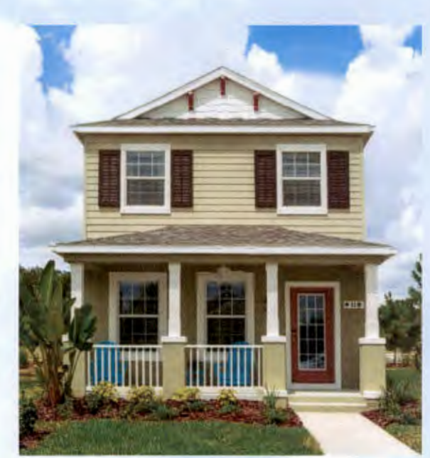
These homes have been popular with the young professional and families with young children demographic.

Our Summer Cottage featured in the Silverleaf community