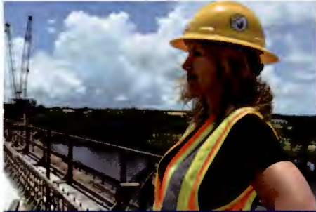
Construction in Progress