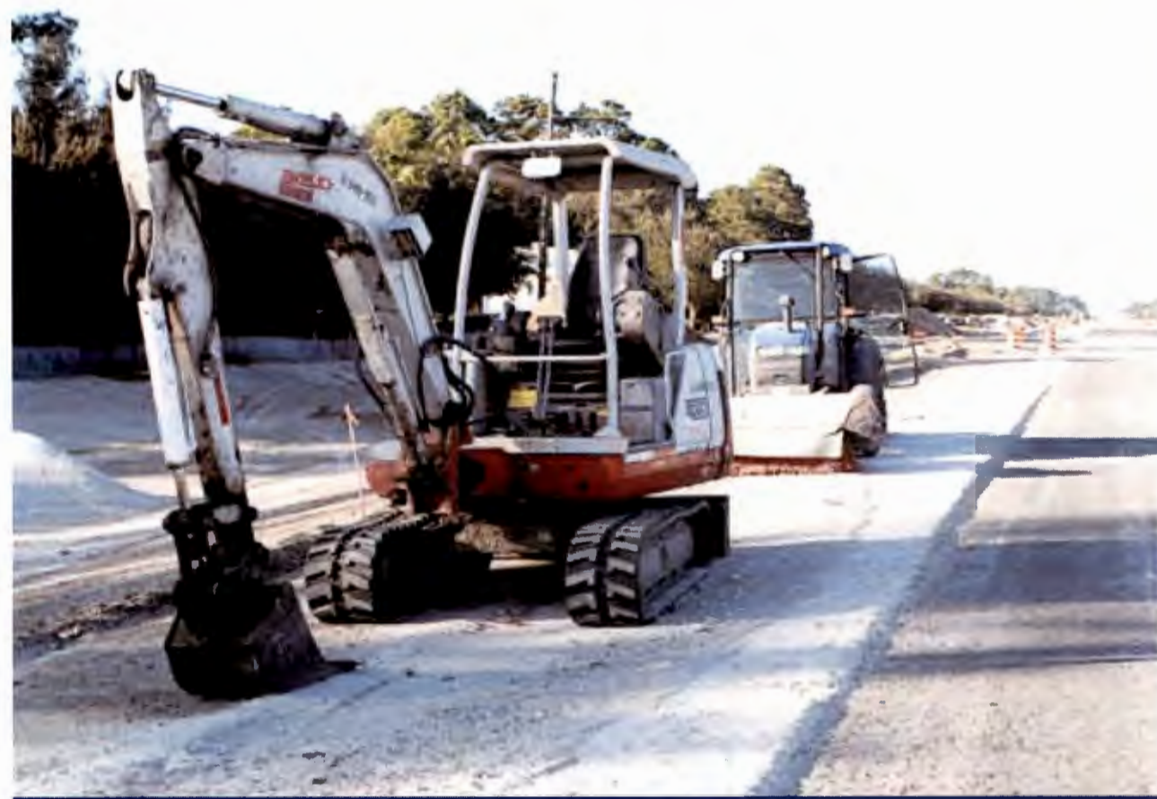
Toledo Blade Boulevard: 30% Under Budget