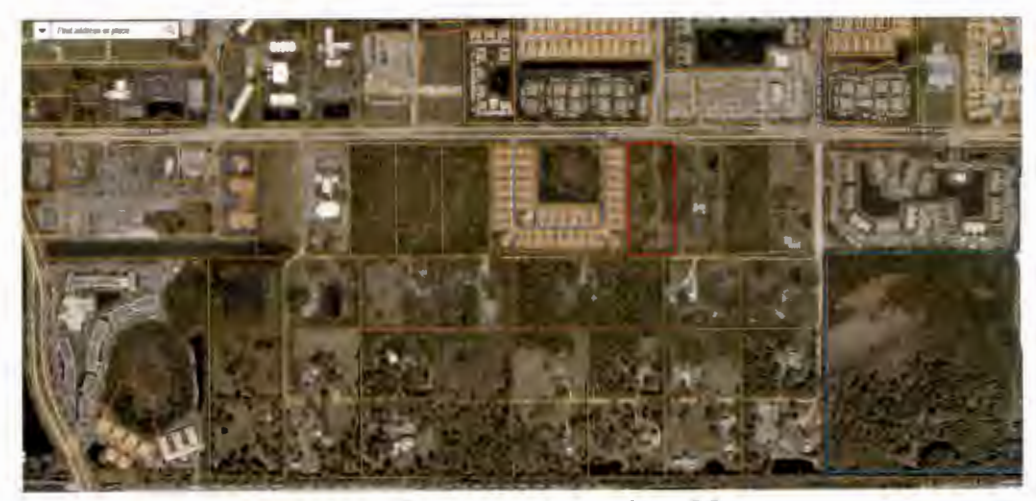
County Property Appraiser Map