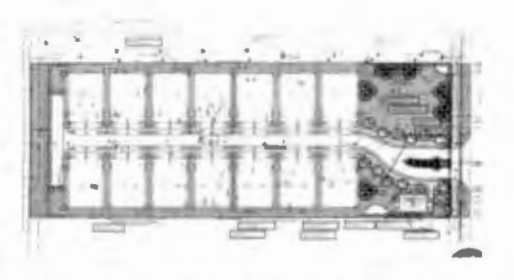
Proposed - 28 Homes - Clear Cut Site - Dig Ponds (shaded area represents ponds/drainage swales)

Proposed project includes 5.07 +/- ac of land on East Venice Ave directly across from La Pavia Boulevard currently zoned RMF-2 with the Venice Gateway Overlay (VG). Action before the Planning Commission on April 2, 2019 is a review of a Preliminary Plat consisting of 28 residential homes and variances (called modifications by the applicant, identified as variances by staff) to COV Chapter 86 Land Development Code (Zoning Laws).