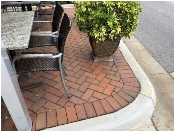
Clay Brick (Venice & Tampa Avenue)