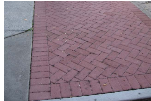
Re-used Concrete (Miami Avenue)