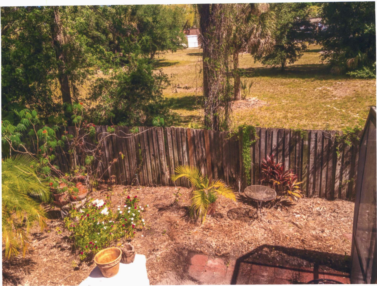
Boundary fence behind 1350 Lucaya (8 feet from pool cage / patio) Proposed site plan distributed provided by Mr. Boone showed over 37 parking spaces bordering on this fence plus many more elsewhere.