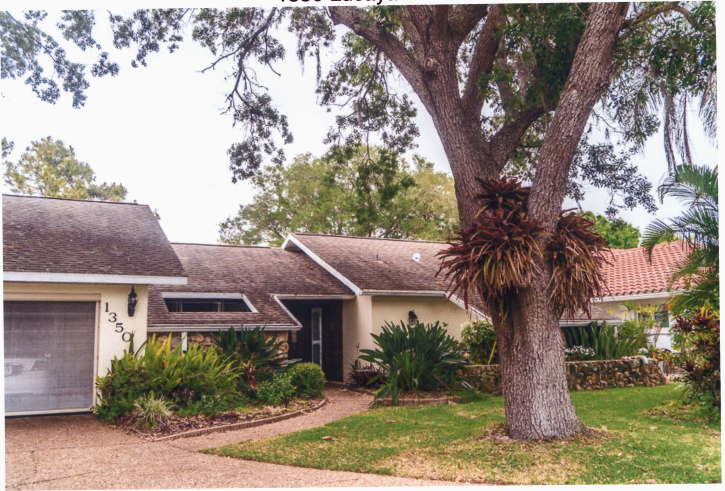
1354 Lucaya Ave.