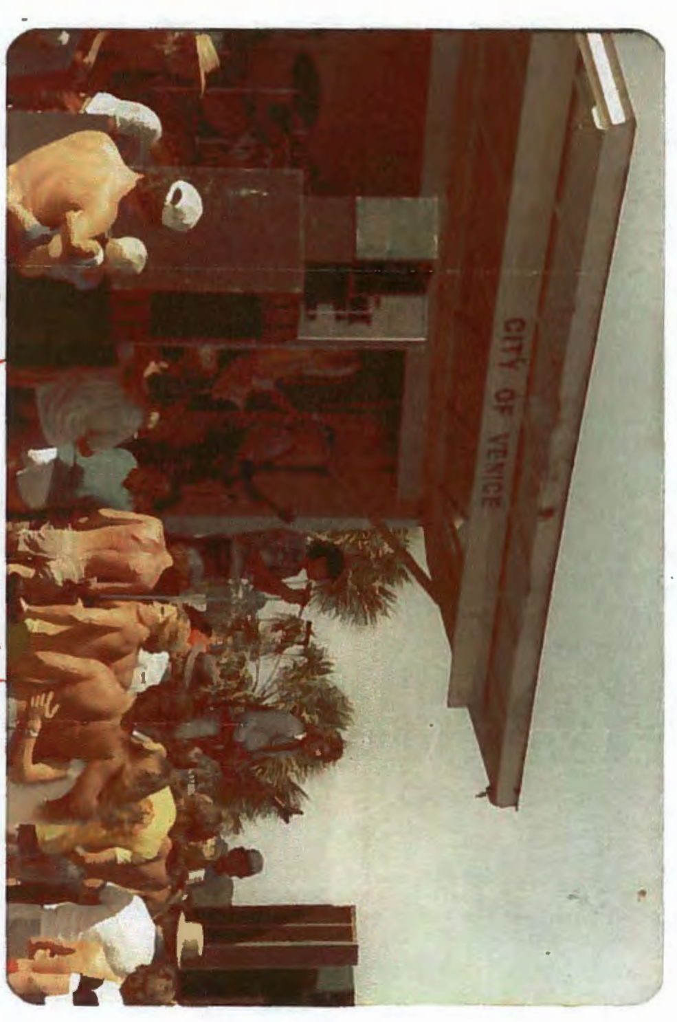
MESMY Bond ON Strow mobile 1979