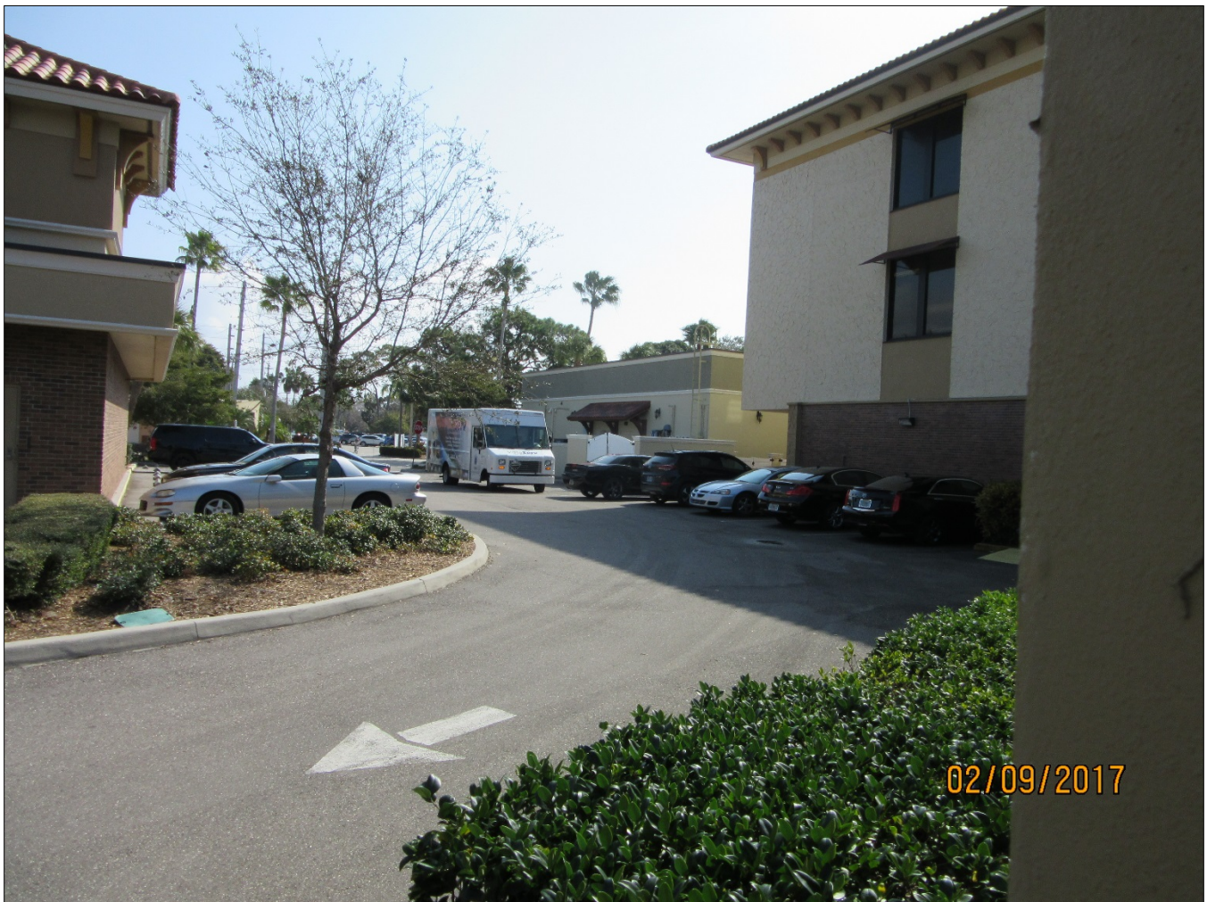
View of existing loading zone at rear of Daiquiri Deck.

uses on the site are the proposed project of 5,000 square feet of office use and the existing 38,000 square foot Bank of America office building for total office use in excess of 40,000 square feet. Based on these calculations, two additional loading zones are required for code compliance for all existing and proposed uses. The applicant is providing a second loading zone located just west of the existing loading zone and has indicated the property currently functions without issue. The city has no indication to the contrary. For these reasons, a third loading zone is not being proposed and the applicant is seeking relief from this additional requirement. In reality, the applicant could identify a standard parking space as a third loading zone due to the code's lack of a minimum size standard, however, staff agrees with the applicant that the elimination of a parking space would be more of a detriment to the site than any advantage gained by the additional loading facility. Staff is also proposing a stipulation that loading and unloading associated with this property will be prohibited in the right-of-way. Based on the applicant's submittal and staff analysis, Planning Commission can make a positive finding that the public interest will not be adversely affected by the proposed special exception.