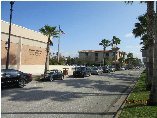
View looking east.