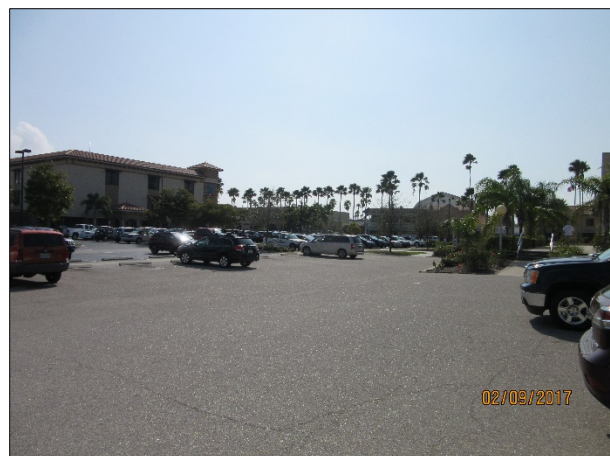
View looking southeast.