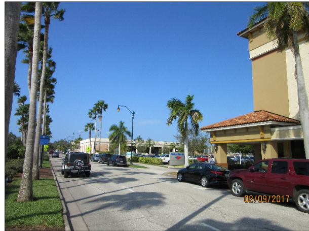
View looking west.