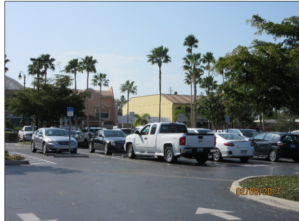
Building location from Tampa Ave.