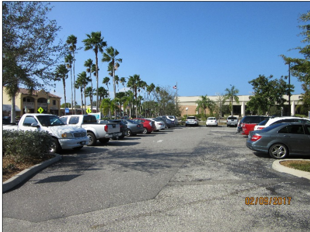
Proposed building location.