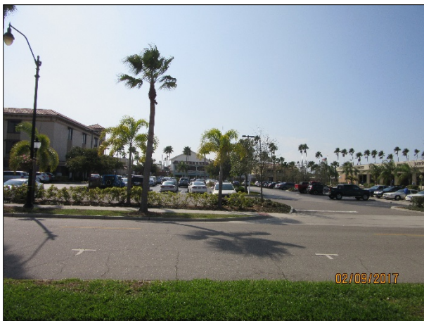
View looking south.