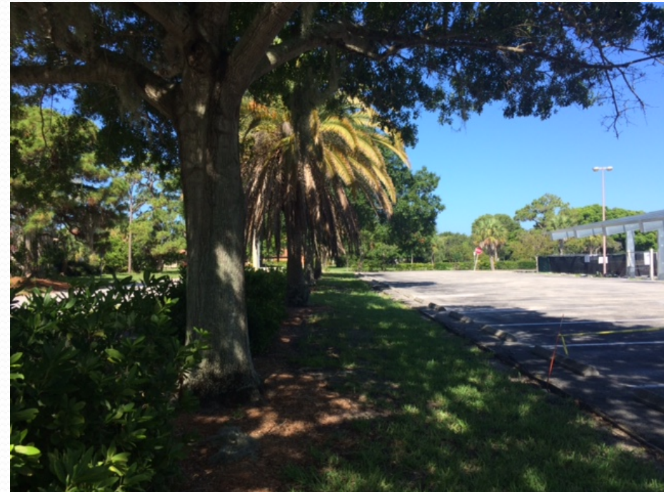
Landscape Buffer to be Enhanced