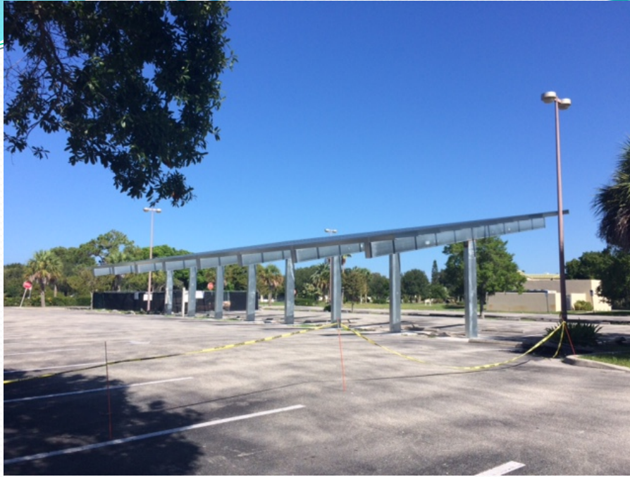
Solar Array Under Construction