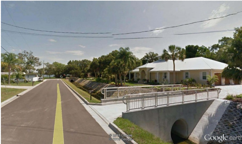
8" Curbing along Ditch