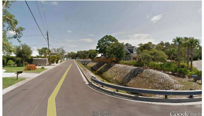
Portions protected with Guardrail and Pedestrian Railing