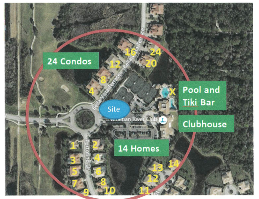
4-Condos per unit = 24 + 14 Homes = 36 Homeowners Affected (min) Plus Those at the pool and Tiki Bar

The Radius is about 400 hundred feet – Pickleball Noise travels that far