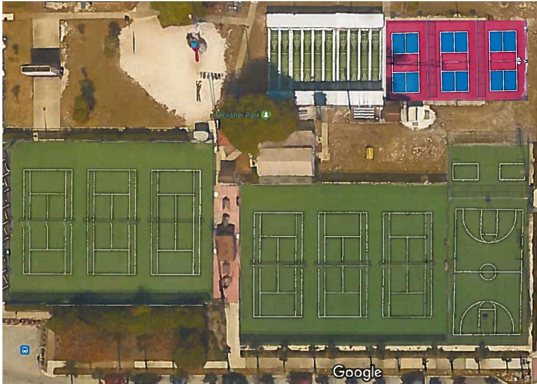
Three pickle-ball courts (aligned N-S) in shuffle-board area