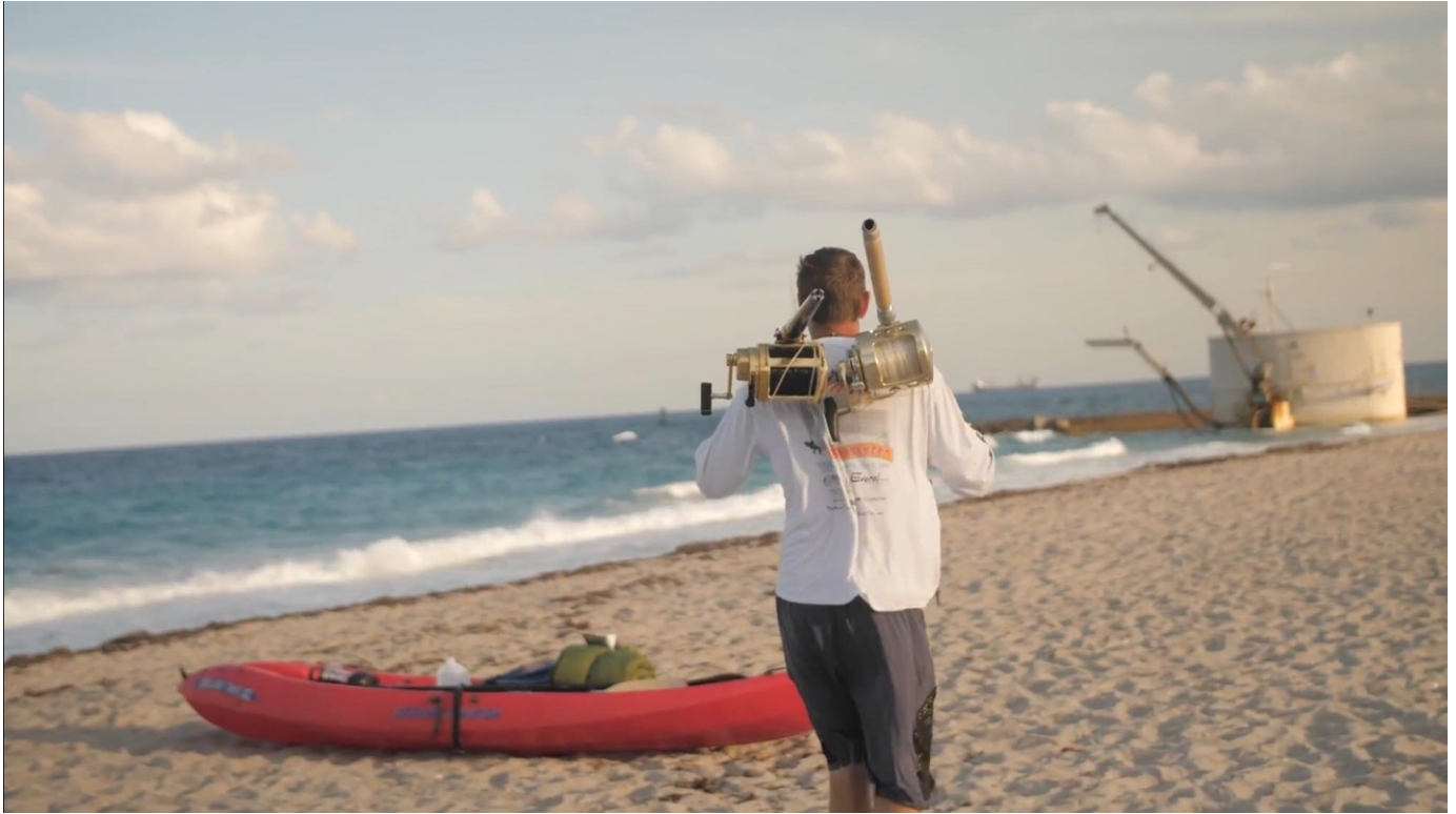
Daytime shark fishing at a popular tourist and surf location, located directly behind the Marriott Resort. "The Pump House," Singer Island, FL