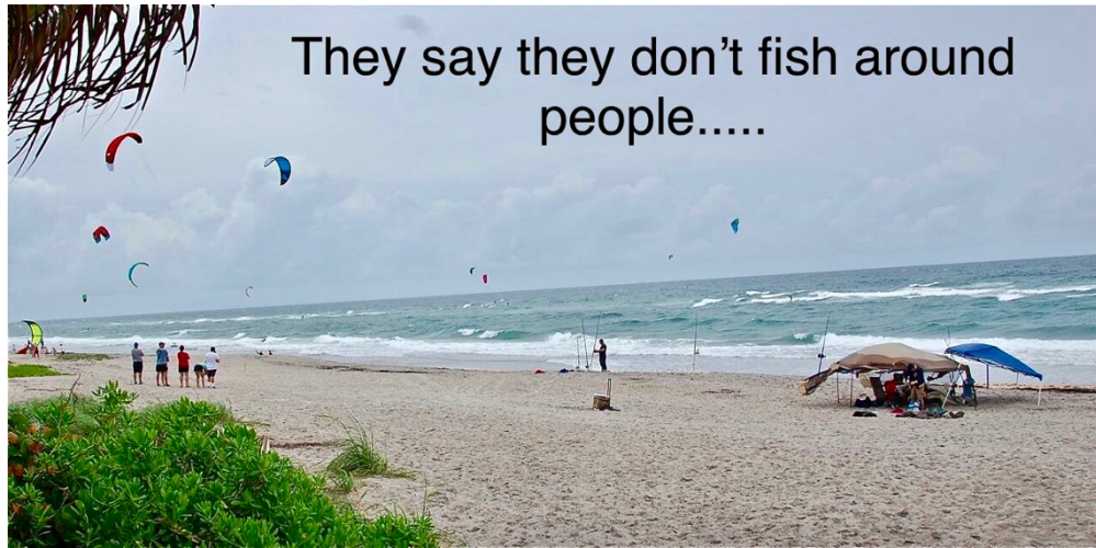
Jupiter, FL “Kite Beach” Memorial Day weekend, May 26, 2018