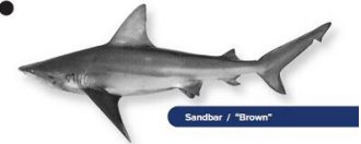
Sandbar / "Brown"