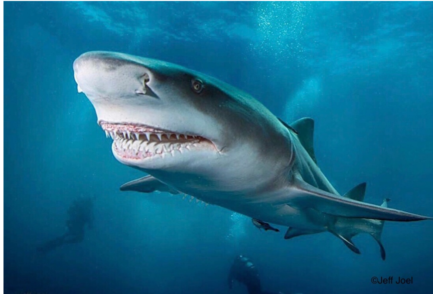
“Miss Snooty”