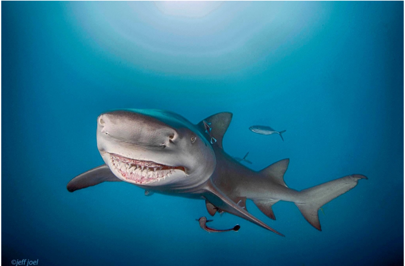
“Miss Snooty”

Sharks are beautiful animals, and if you're lucky enough to see lots of them, that means that you're in a healthy ocean. You should be afraid if you are in the ocean and don't see sharks. -Sylvia Earle