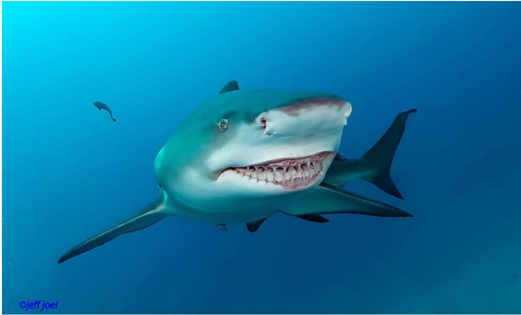
"Miss Snooty"