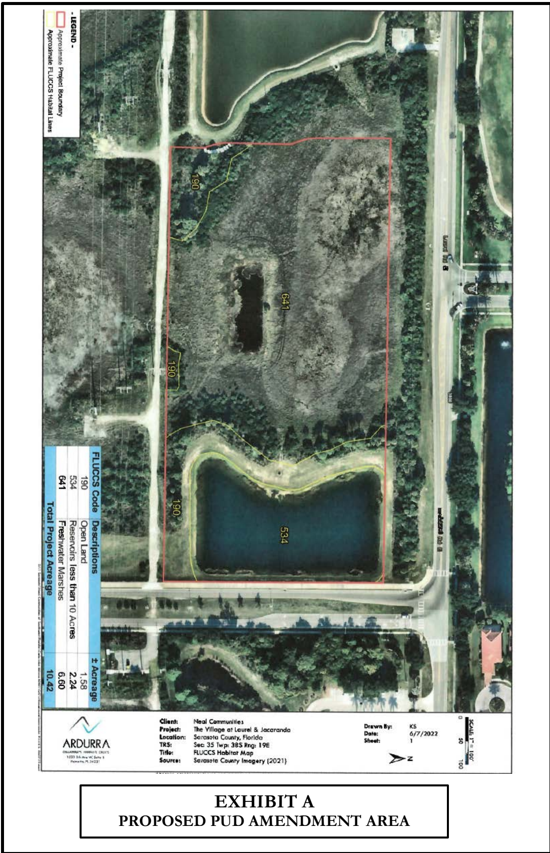
EXHIBIT A PROPOSED PUD AMENDMENT AREA