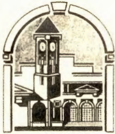
"City on the Gulf"