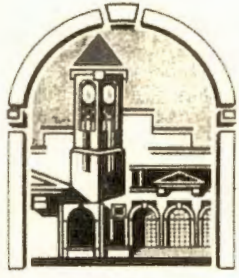
"City on the Gulf"