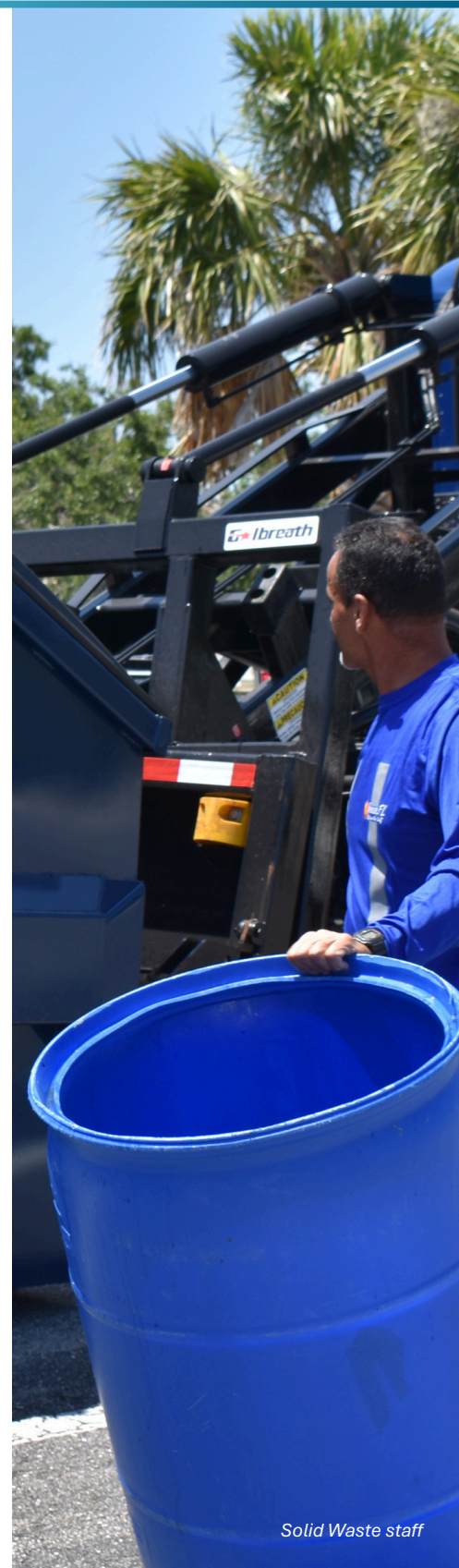
Solid Waste staff