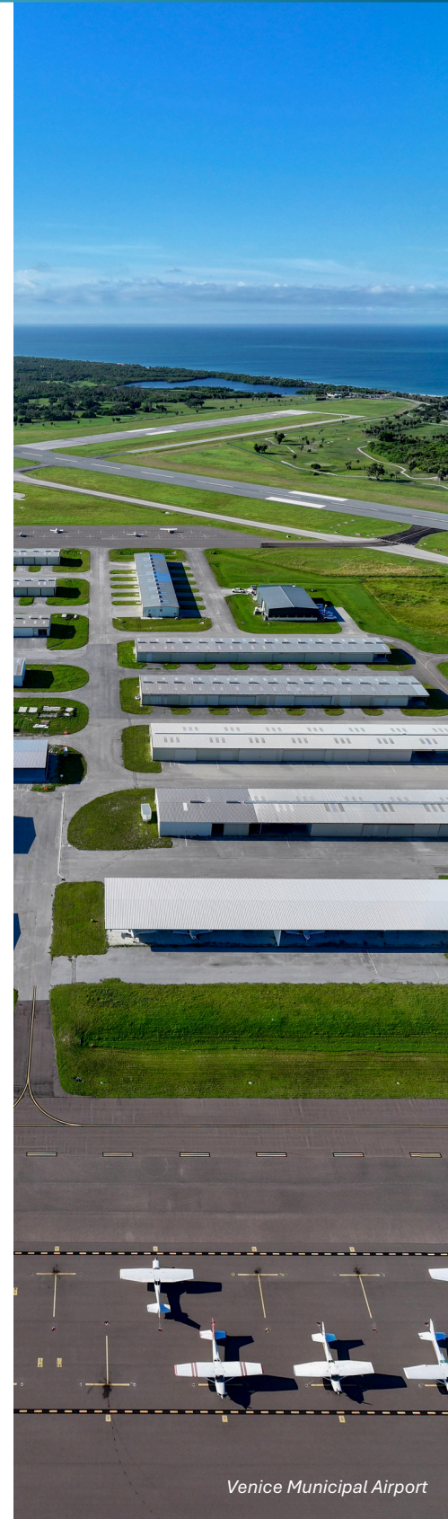
Venice Municipal Airport