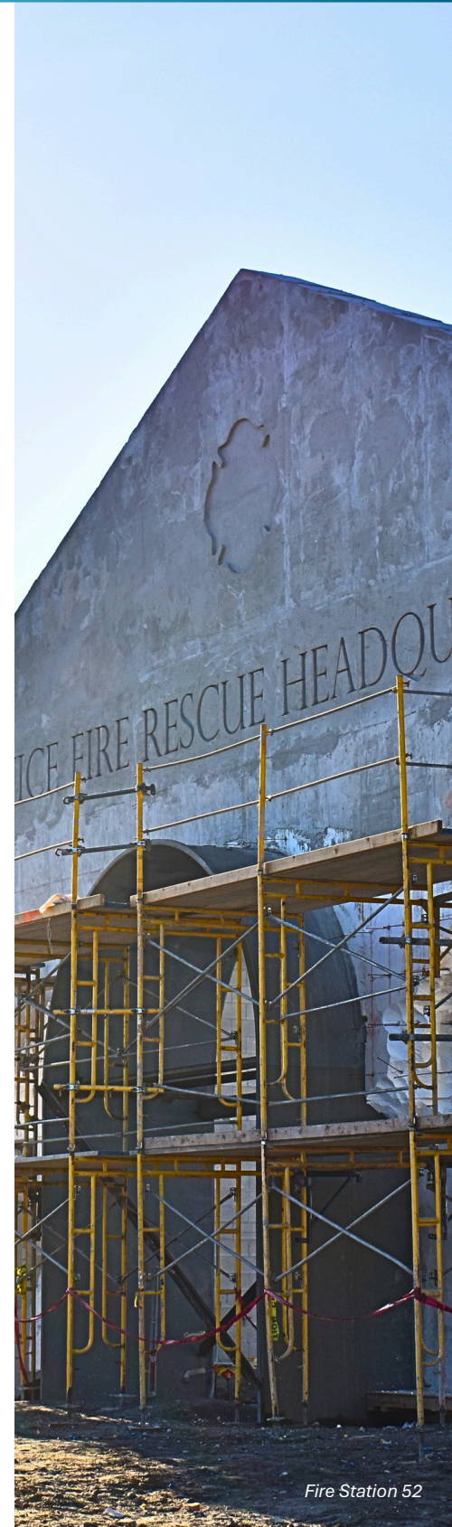
Fire Station 52