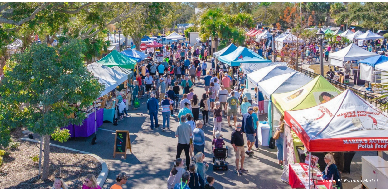
Venice FL Farmers Market

“Encourage and support a robust and diverse economy”