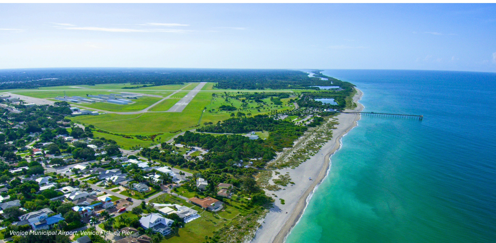
Venice Municipal Airport, Venice Fishing Pier

“Provide efficient, responsive government with exceptional municipal service”