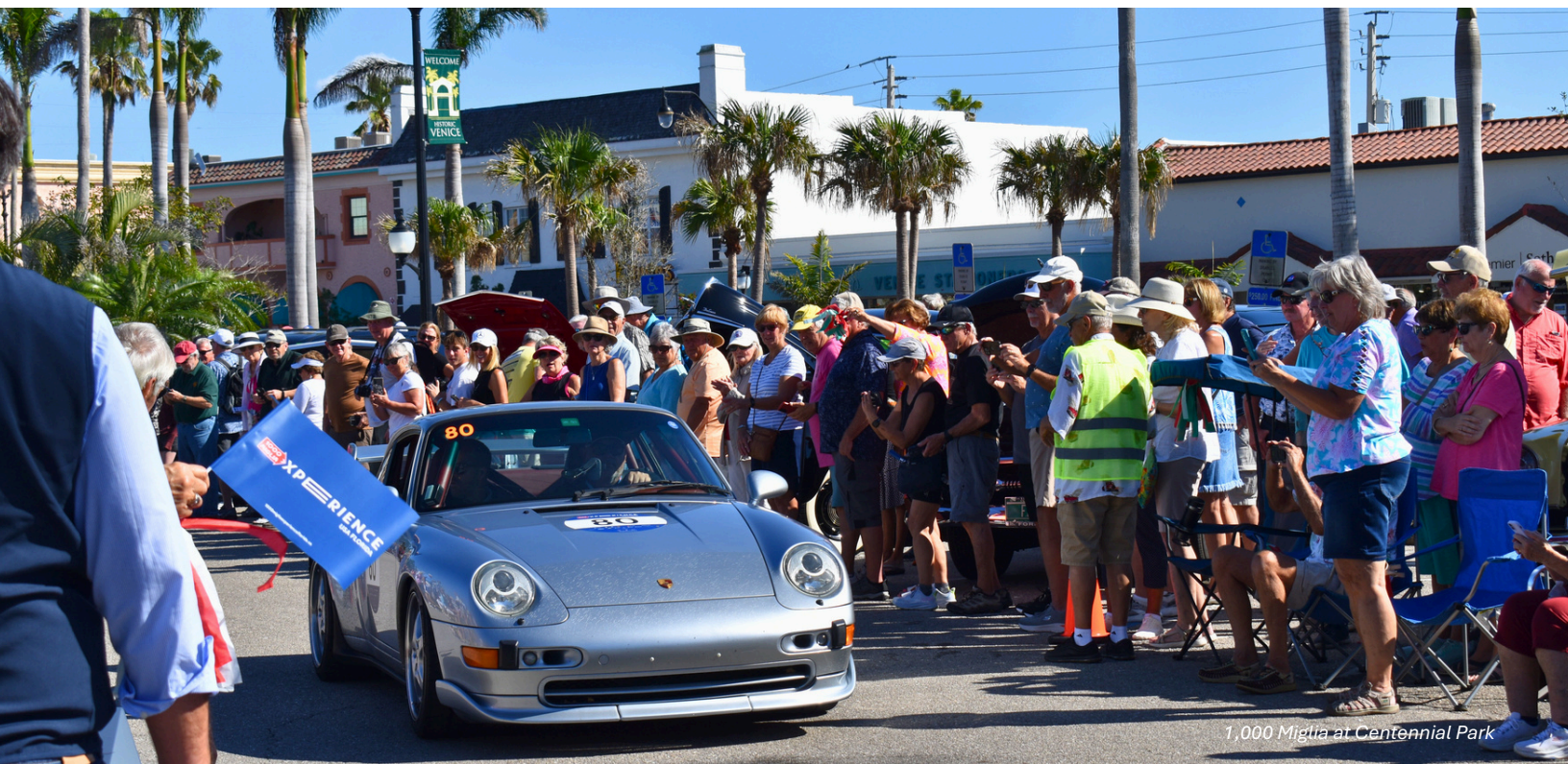
1,000 Miglia at Centennial Park

“Preserve the Venice quality of life through proper planning”