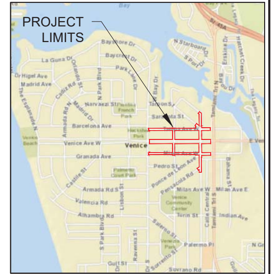
SCALE: 1" = 0.5 mile