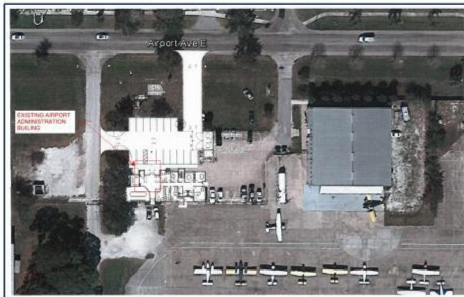
Exhibit 1- Project Location