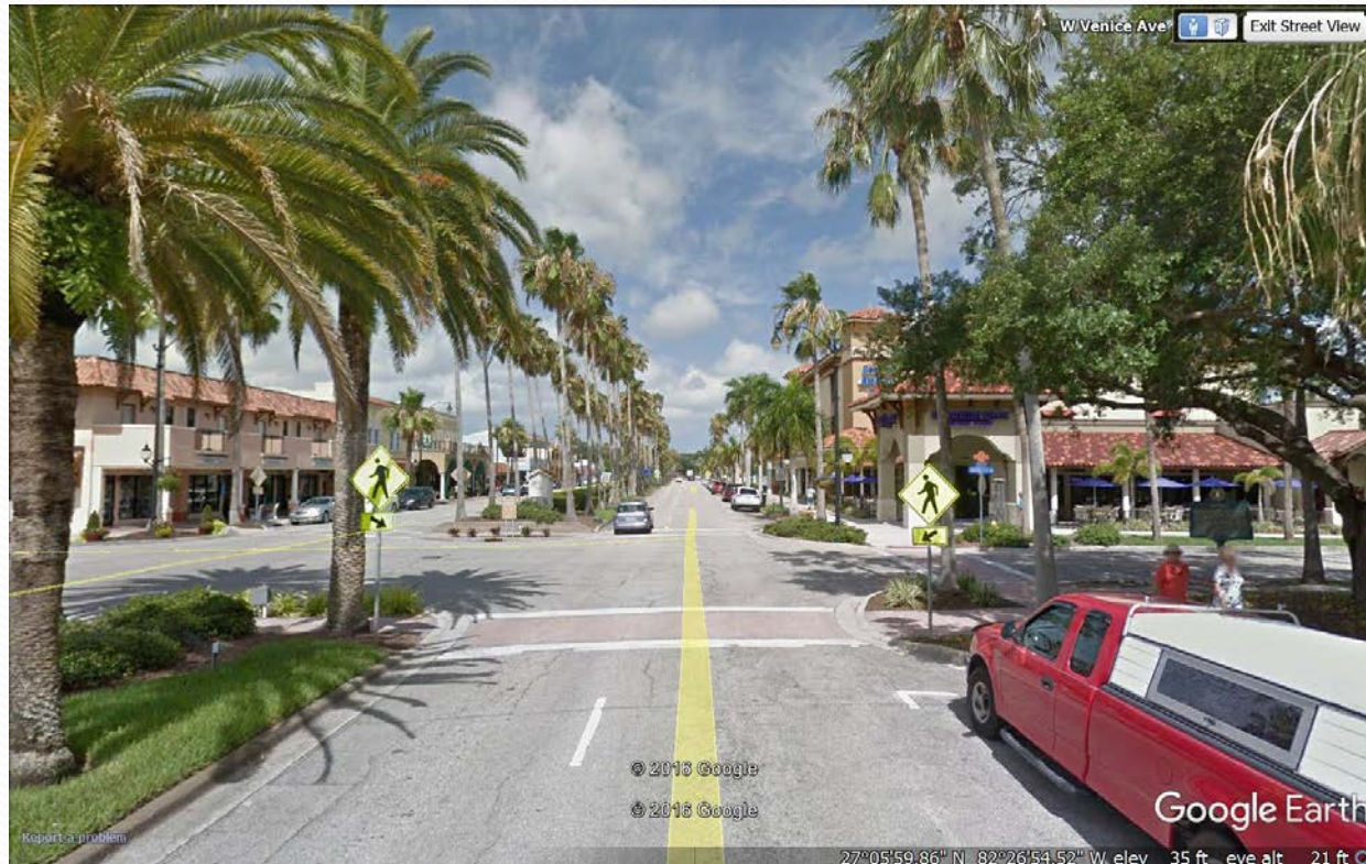
North Side of Road