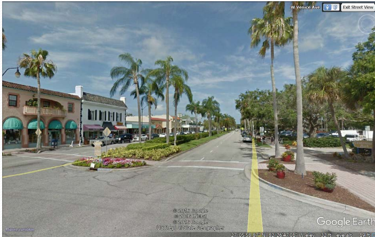
North Side of Road