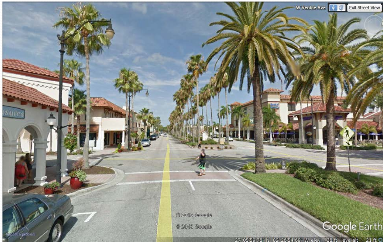
South Side of Road