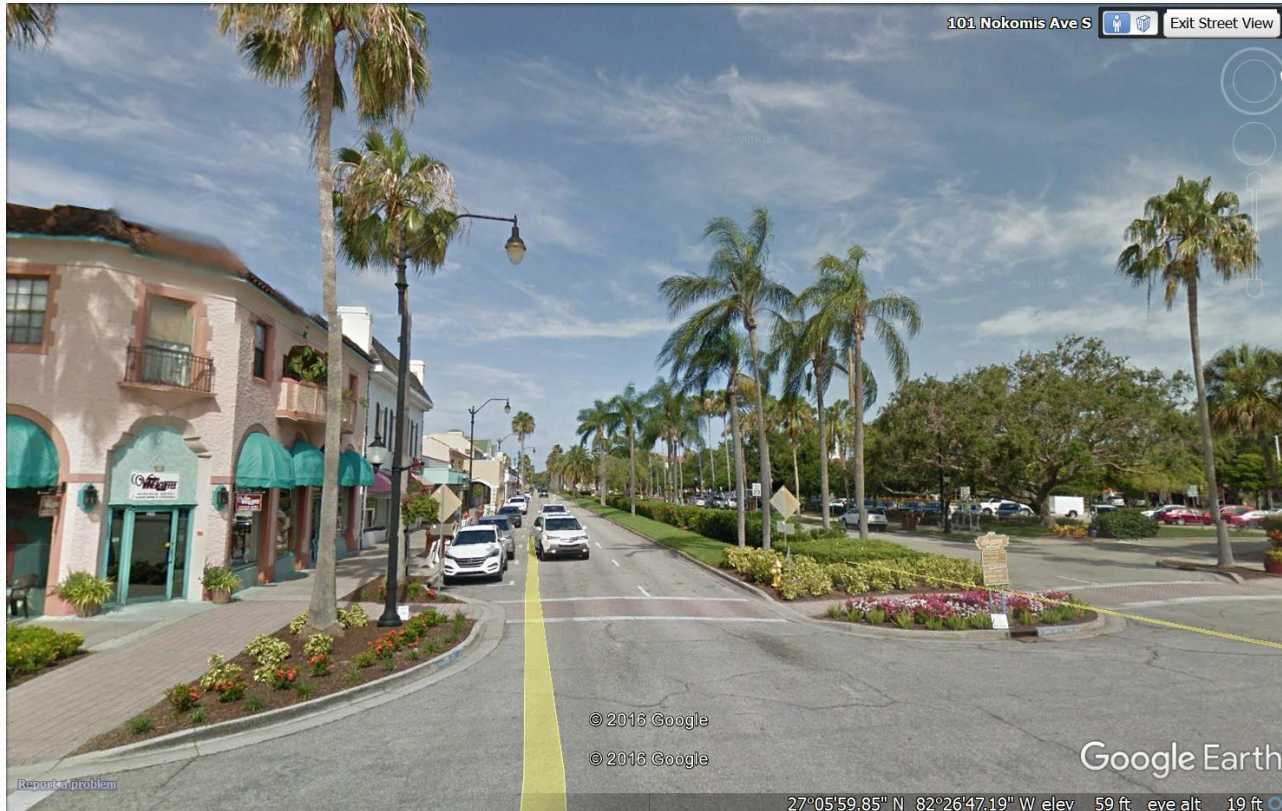
South Side of Road