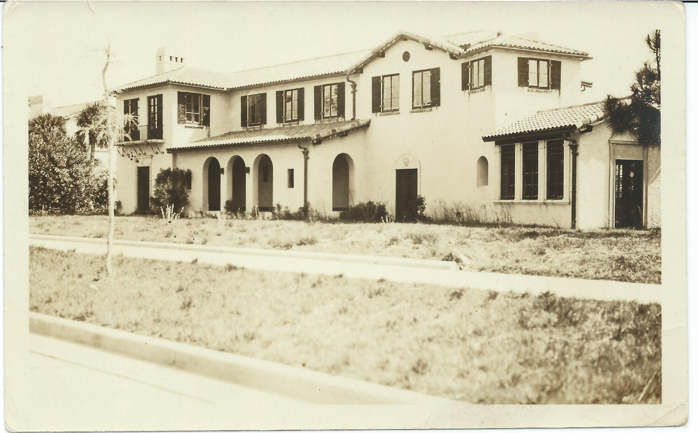
613 W. Venice Ave. ca 1937