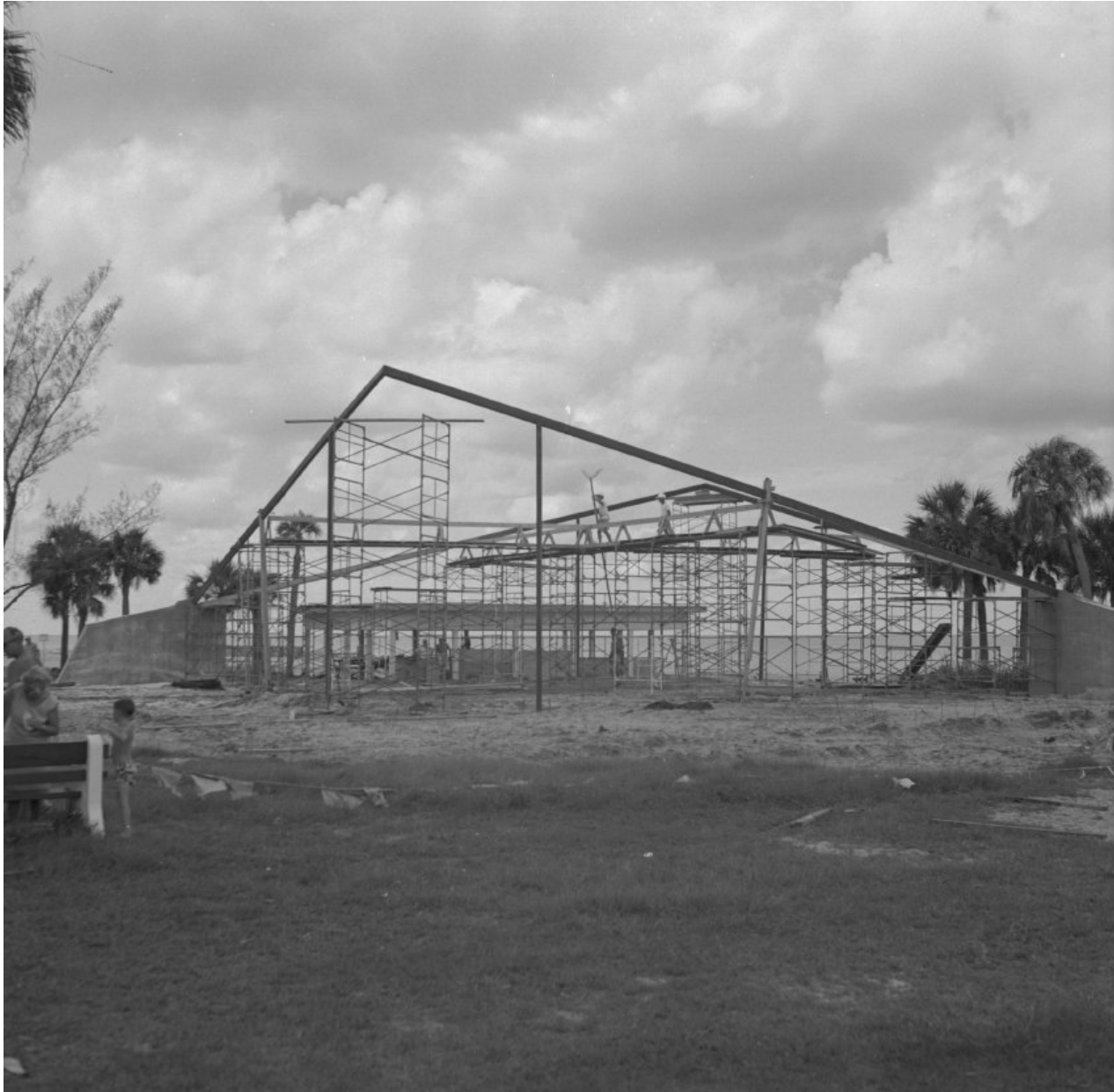
Construction begins on the hyperbolic paraboloid roof, ca. 1963.