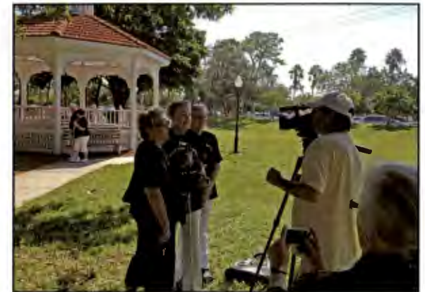
Government officials join co-sponsors at downtown Gazebo.