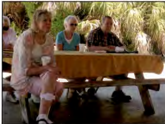
Picnics at Shamrock Park for fun.