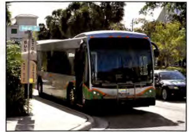
SCAT PLUS buses are key transportation services.