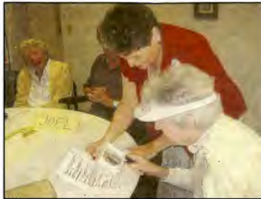
Lighthouse of Manasota teaches applied skills.