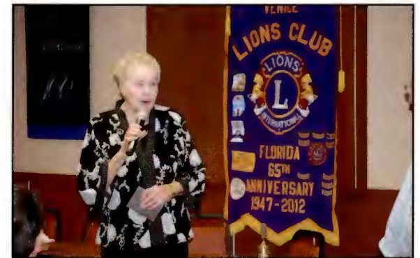
Venice Lion Club awards grants to Venice Chapter.