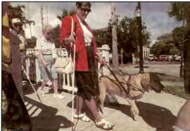
National White Cane Safety Day in October celebrates the occasion with a stroll through downtown Venice and a banquet.