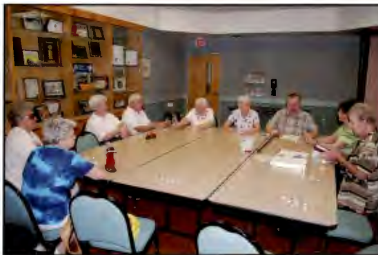
Membership meetings often include speakers.