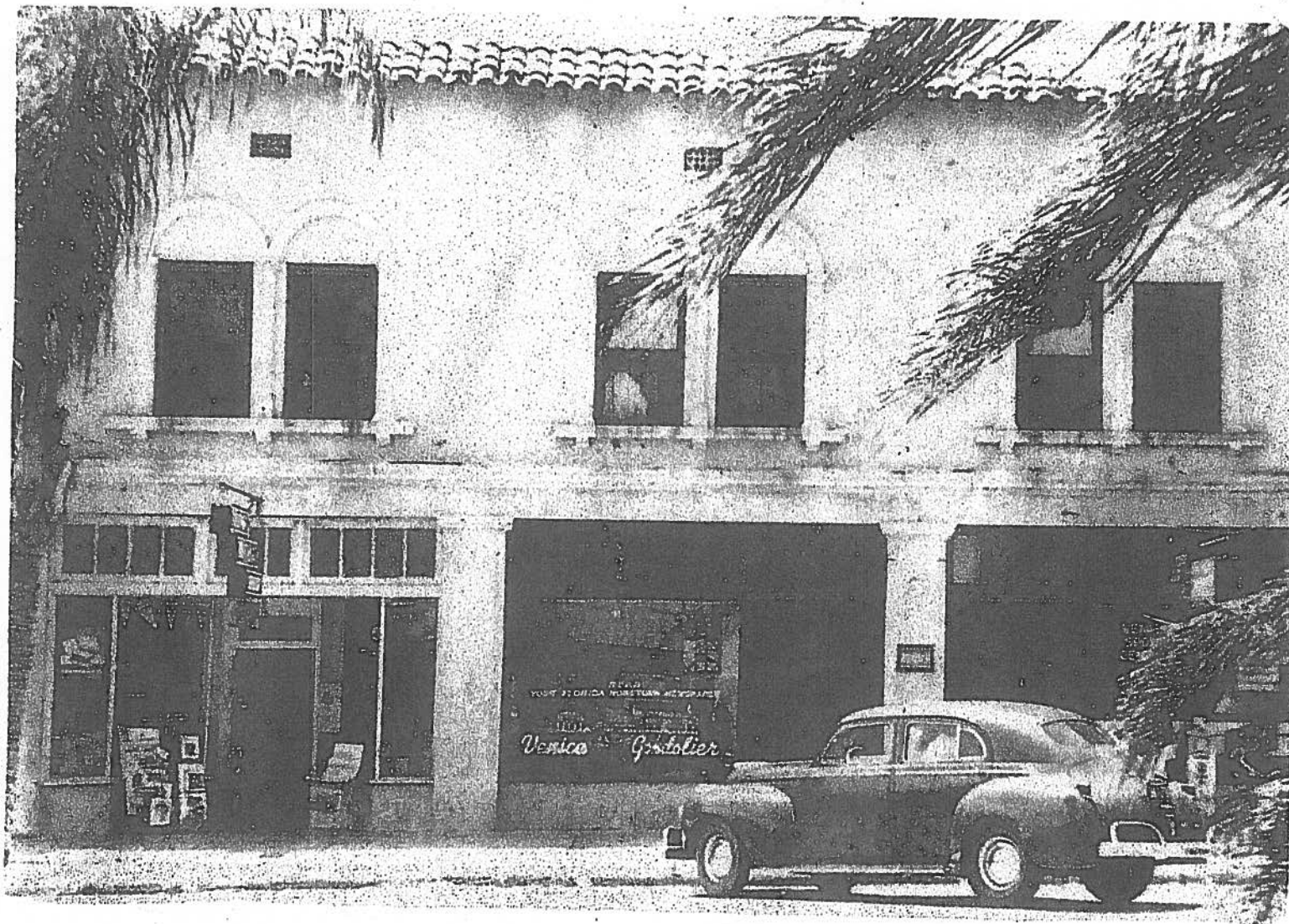
PHOTO 5/23/2001 0187 PRT Venice Avenue, 300 block

Ret Code- File Ref #....-0187 Cont- Security Class- Exp - Referred to....-