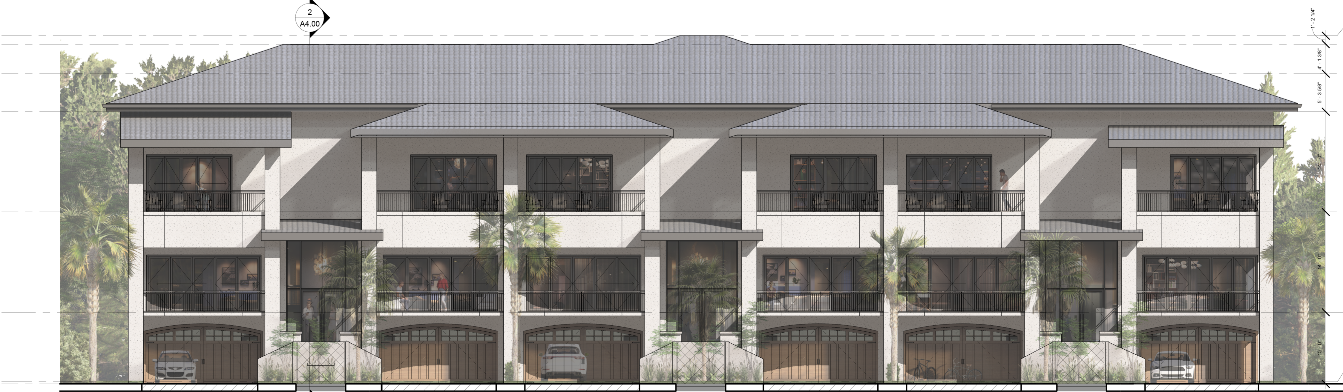
2 South Elevation 1/8" = 1'-0"