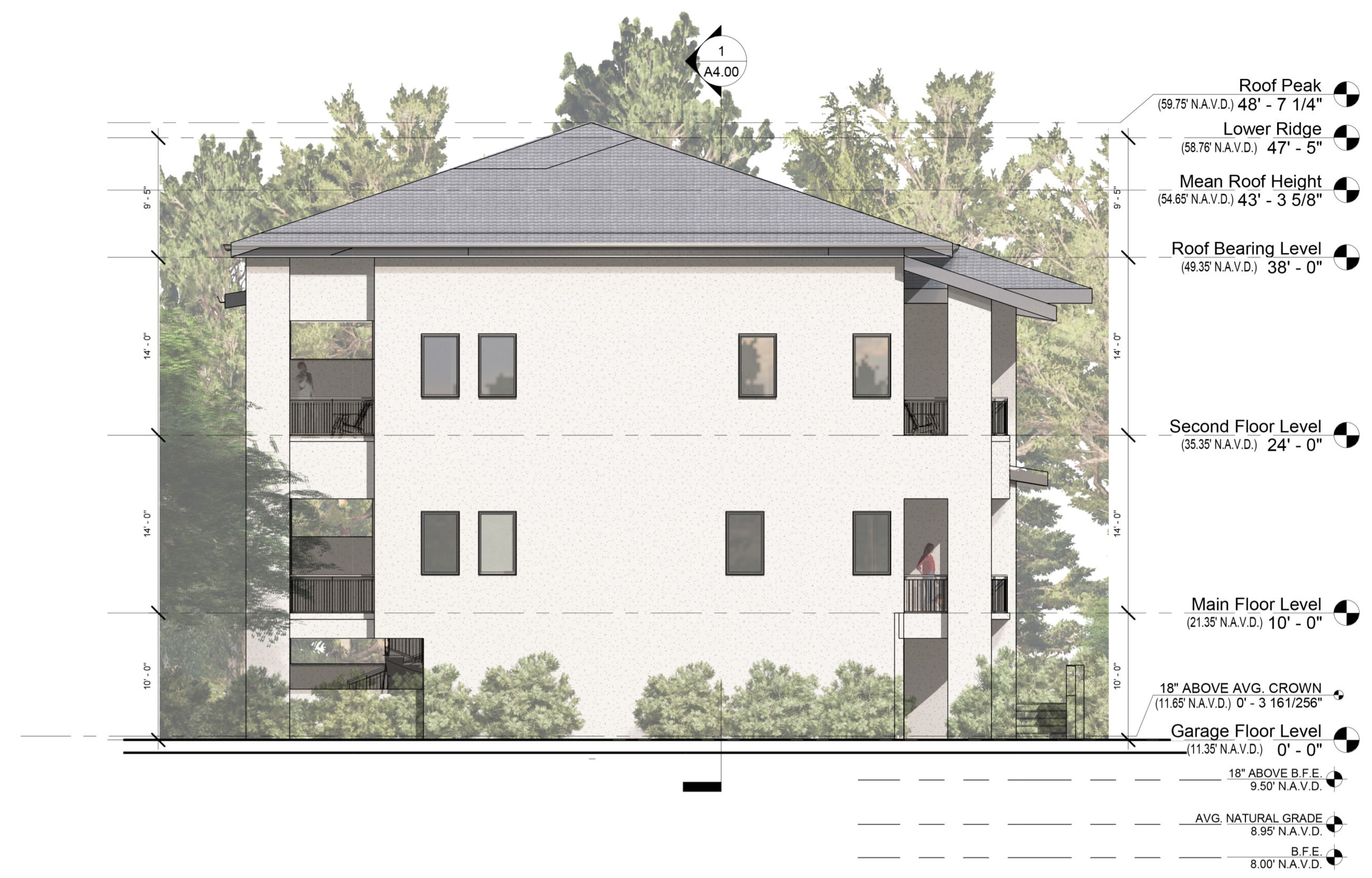
2 West Elevation A2.01 1/8" = 1'-0"