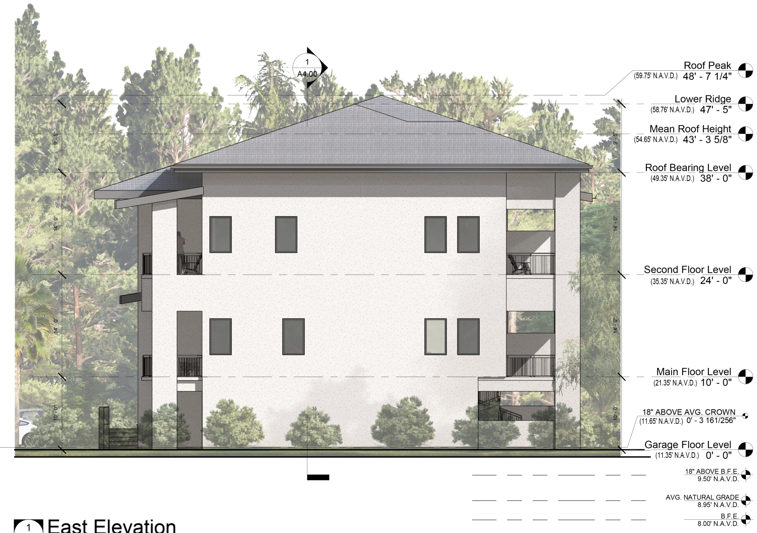
1 East Elevation A2.01 1/8" = 1'-0"