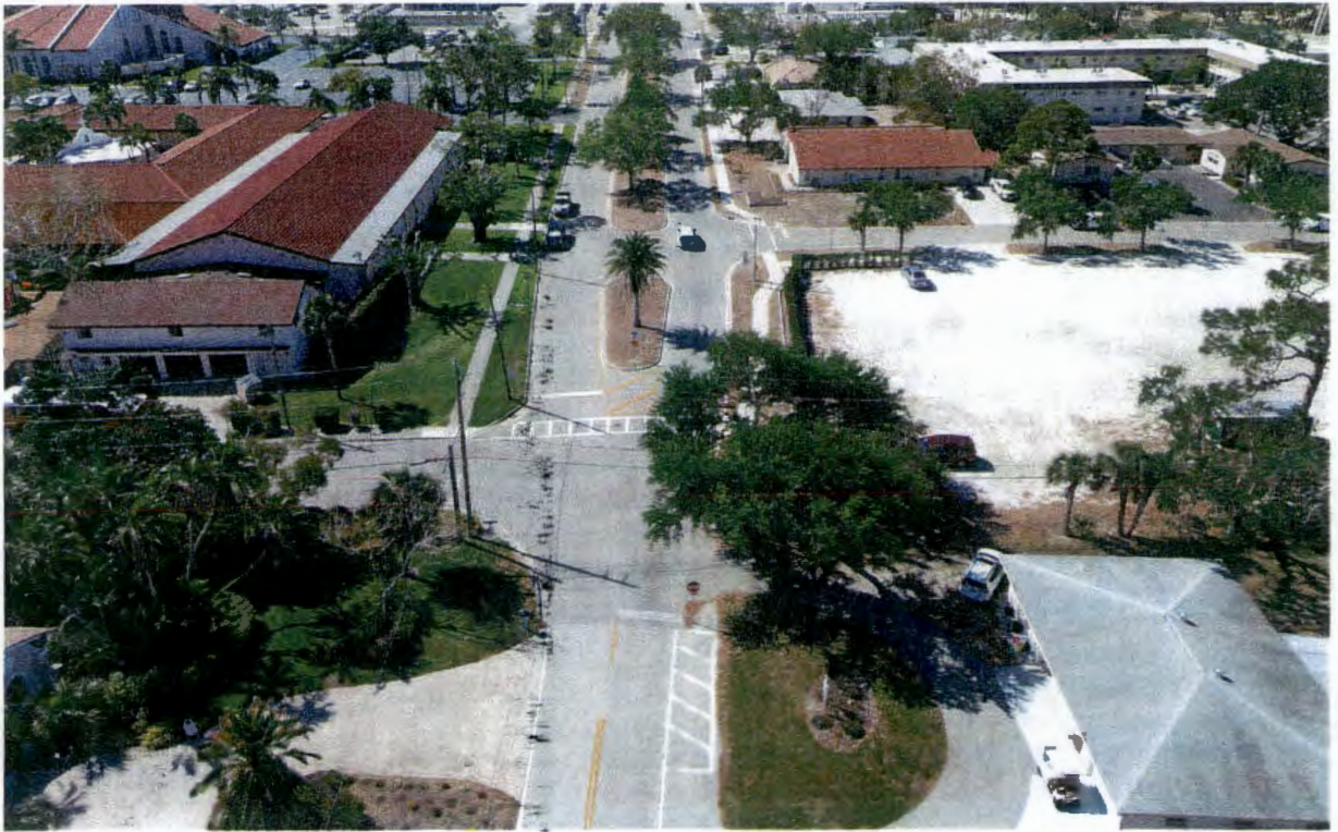
Narrowing of Harbor to Bayshore Dr.