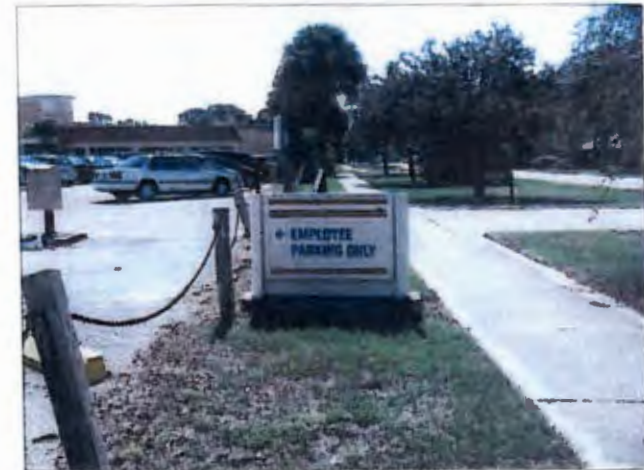
Existing Sign B1.4 (Side #2)