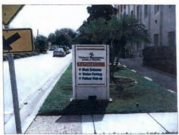
Existing Sign B2.2 (Side #1)