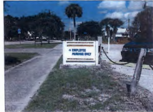
Existing Sign B1.4 (Side #1)