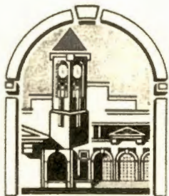
"City on the Gulf"