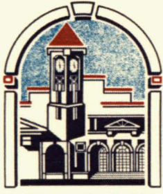
"City on the Gulf"