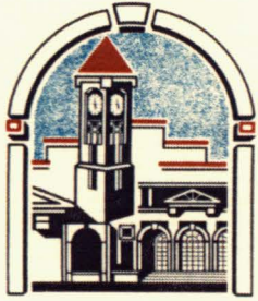
"City on the Gulf"