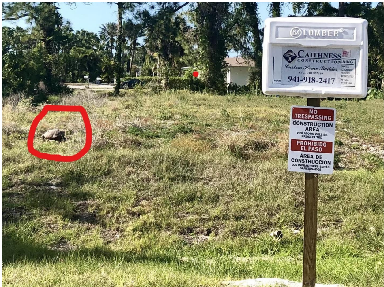
A gopher tortoise at 424 Gulf Drive on the island, whose burrow was paved over by Caithness Construction in 2021.