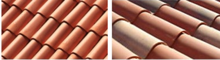
Figure 7.10.5. Permitted Roof Materials and Roof Photos