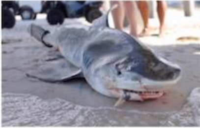
September 10, 2018 8' dead tiger shark, found with a bird's nest worth of fishing line in its mouth, left dangling from a Panama City Pier.